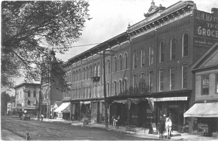
Ann Street Black Business District

The history of African American communities in Ann Arbor traces back to the city's founding in 1827. African Americans built a strong presence in Ann Arbor, establishing businesses, founding churches, and creating social organizations.